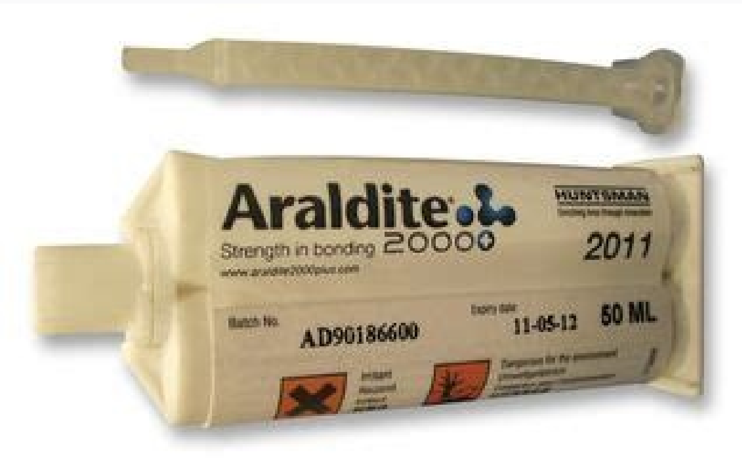
Araldite 2015-1 datasheet. Huntsman araldite 2015 datasheet.